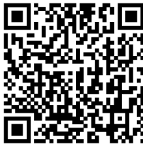
Scan the qr code to sign up to provide candy in your trunk with treats October 29. Thanks!

There is a sign-up sheet in the back hallway for volunteers. Please begin bringing pre-wrapped candy.