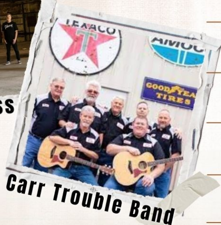
Carr Trouble Band