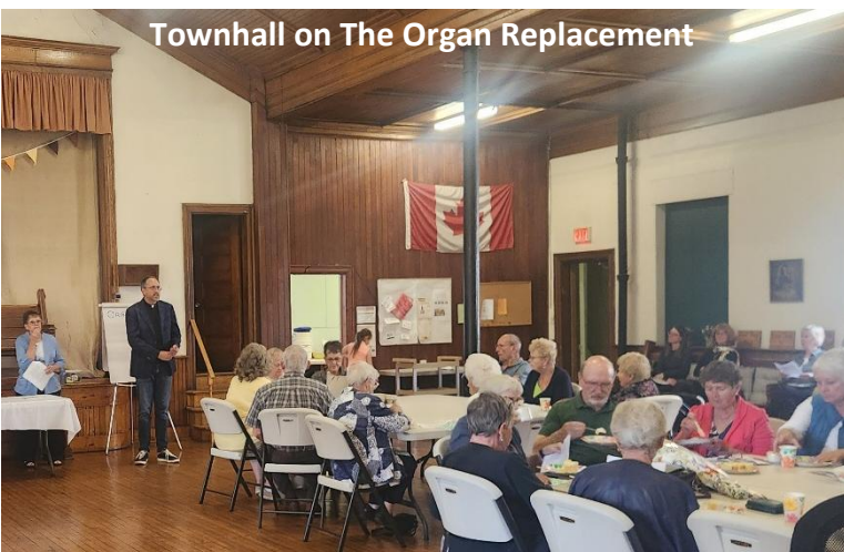
Townhall on The Organ Replacement