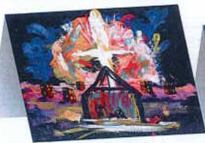
Something Happened in Bethlehem