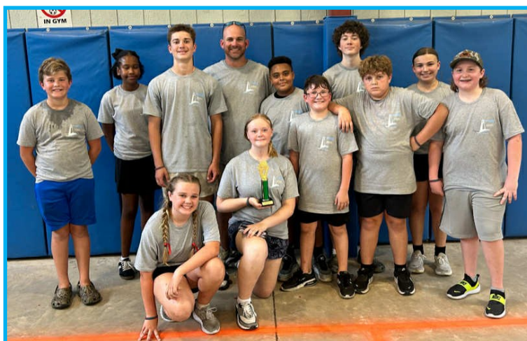
First Baptist Students with 2nd place trophy!