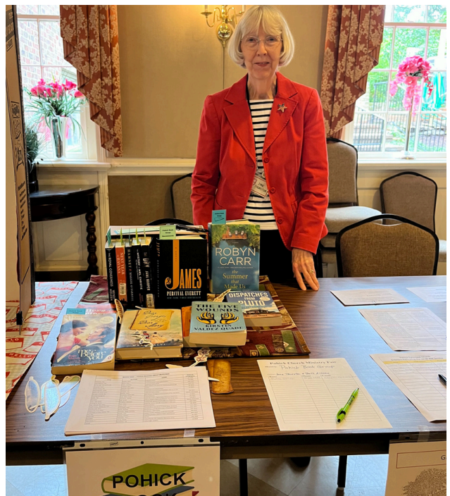
Pohick Book Club.