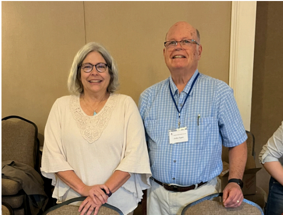
Representatives from Education for Ministry (EFM) and the Docent's Guild.