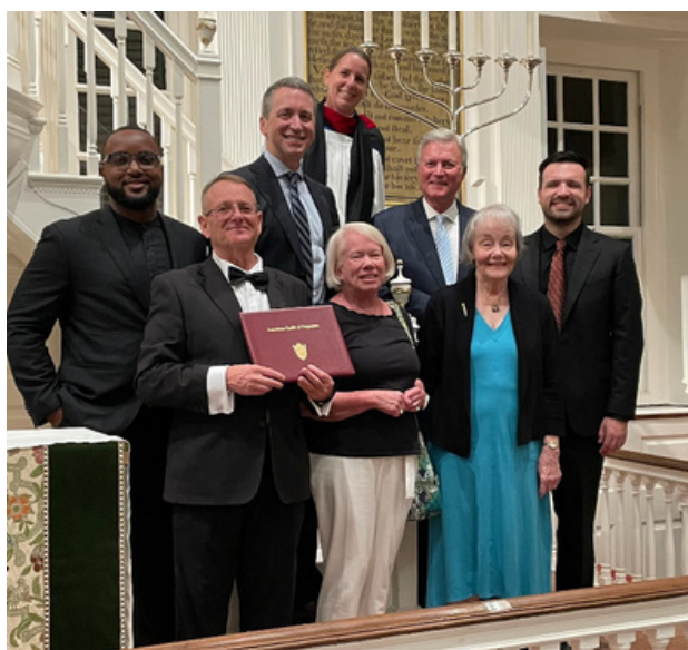
AGO Chapter Hymn Festival Celebration