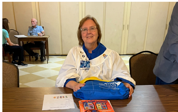
The Bell Choir, St. Francis Choir, Children & Youth Choir and the Choir of Pohick are seeking new members.