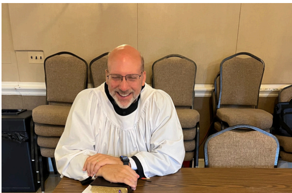
The Lay Eucharist Ministry