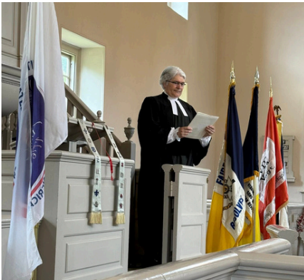
A reading of The Fairfax Resolves