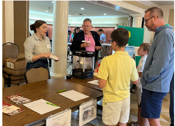
Learning more about EYC