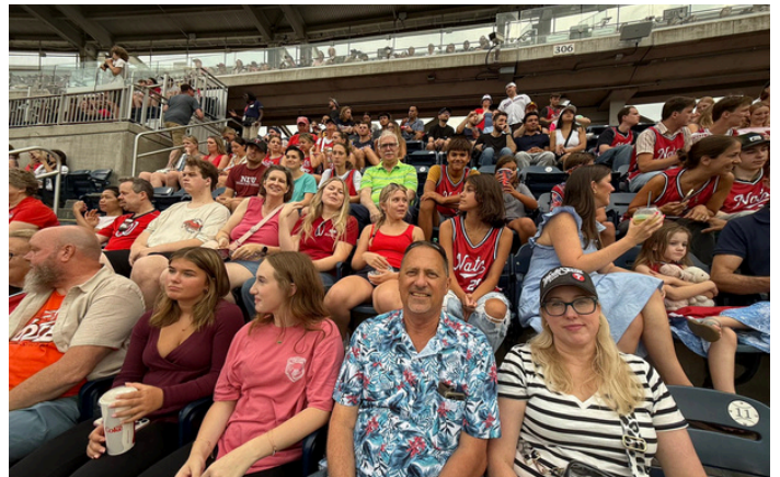
Youth from EYC attended a Nats game together at the conclusion of VBS