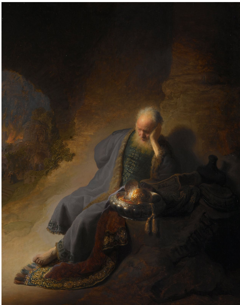
"Jeremiah lamenting the destruction of Jerusalem" Painting by Rembrandt Harmenszoon van Rijn (1606-1669)

The 25 th Sunday in Ordinary Time (15 th Sunday after Pentecost) A Service of the Word