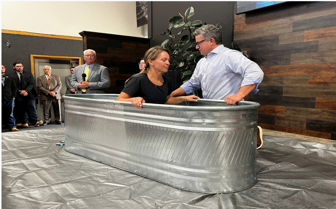
Baptisms Also Happen At Platte Valley Baptist Church Fort Morgan Colorado