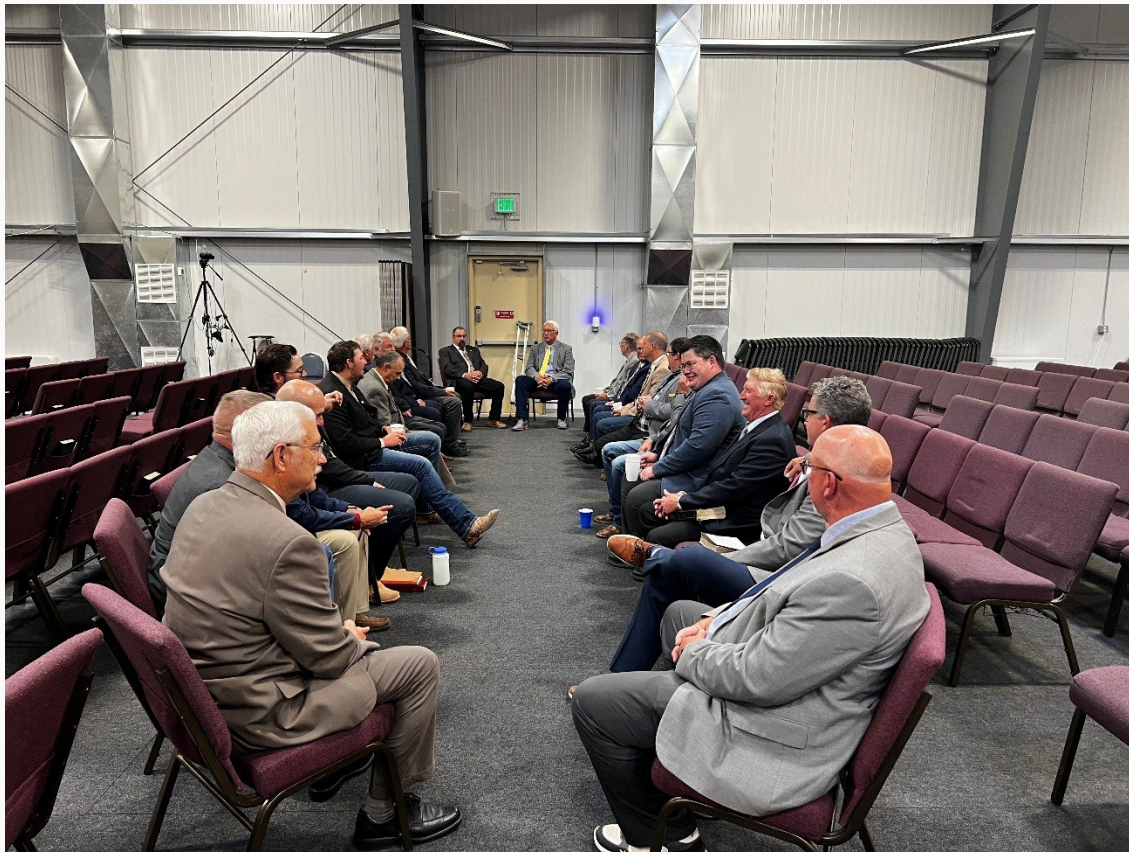
Some Of The Men At Platte Valley Baptist Church, Ft. Morgan Colorado, gather For Prayer Before Each Sunday morning Service