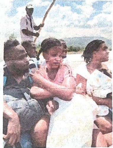
Crossing the Artibonite River

Brothers and sister, the tragedy now, I got 28 people and then I have 2 more coming ahh tomorrow, because they in trouble. (St Luc found favor and temporary housing in Cap Haitien) They (the owner) make a favor now. I don't supposed to have all that people on the house they borrow me, make me a favor to live. But I have all of this people, children, make very little kid and I have to take care of them.