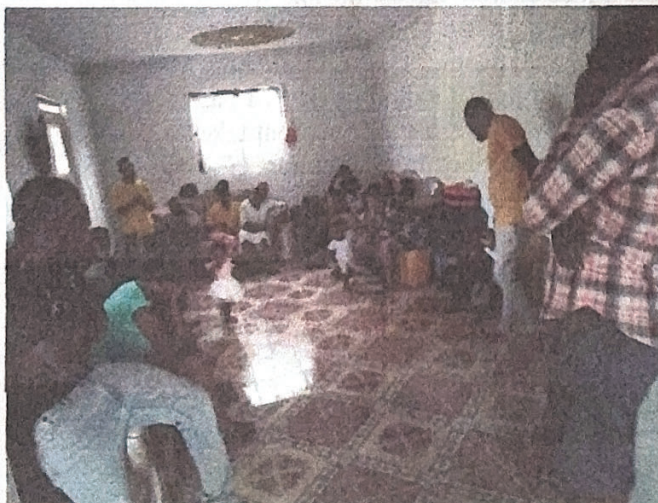
30 refugees in temporary housing, Cap Haitien