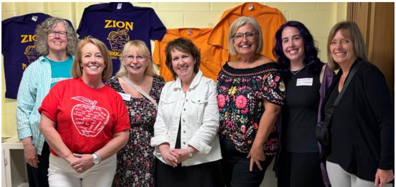
Members of the Kindergarten Staff from years gone by