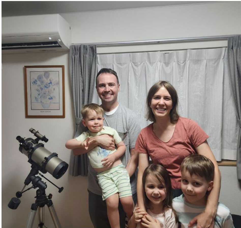
The kids were excited to see moon craters for the first time

One of the biggest surprises to us and our colleagues has been the warm reception we have received in our neighborhood. Sometimes, people living in Tokyo can have a reputation for keeping to themselves; but, our block has welcomed us with open arms. Our neighbours across the street have been particularly hospitable. The wife is a lover of roses and has volunteered many times to help us with our garden projects. Once, she just so happened to have fertilizer for our strawberry plants even though we have never seen any strawberries in her yard!