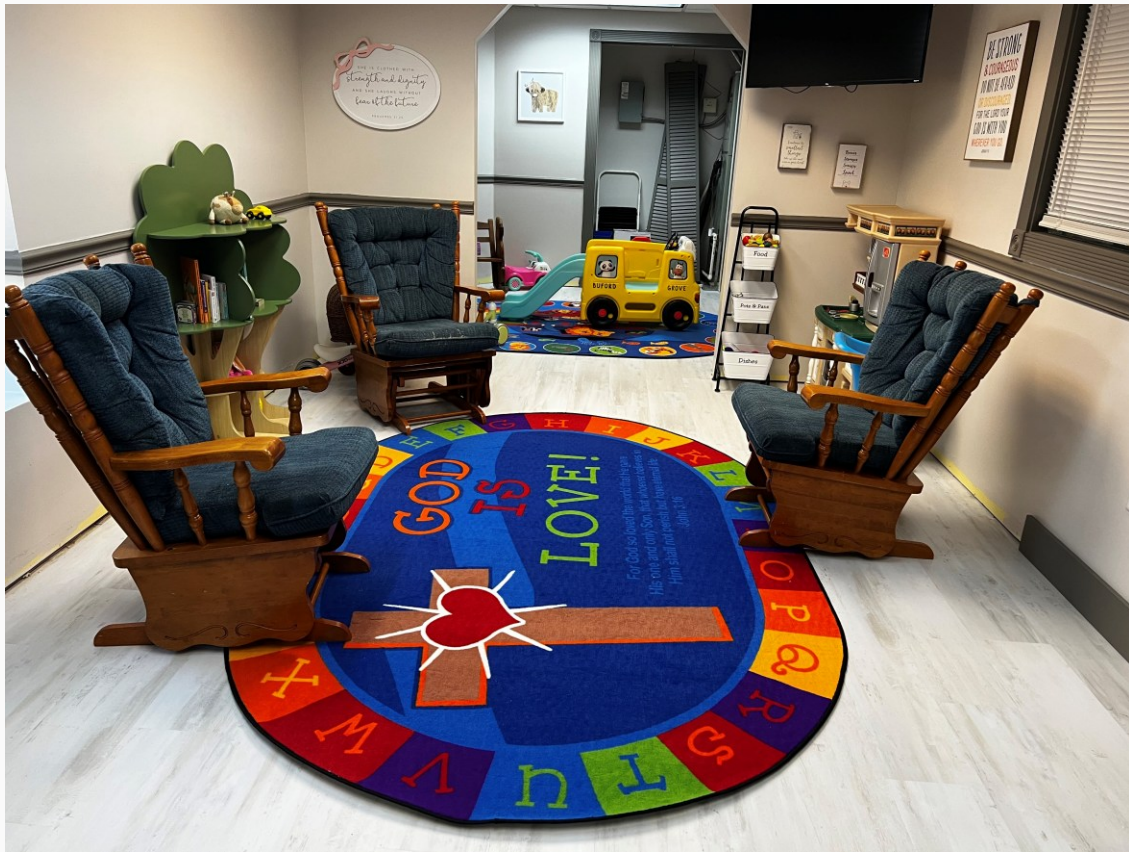
Buford Grove Baptist Church Nursery Project 99% Complete