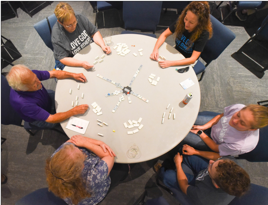
Playing dominos at FBC Family Day 2025.