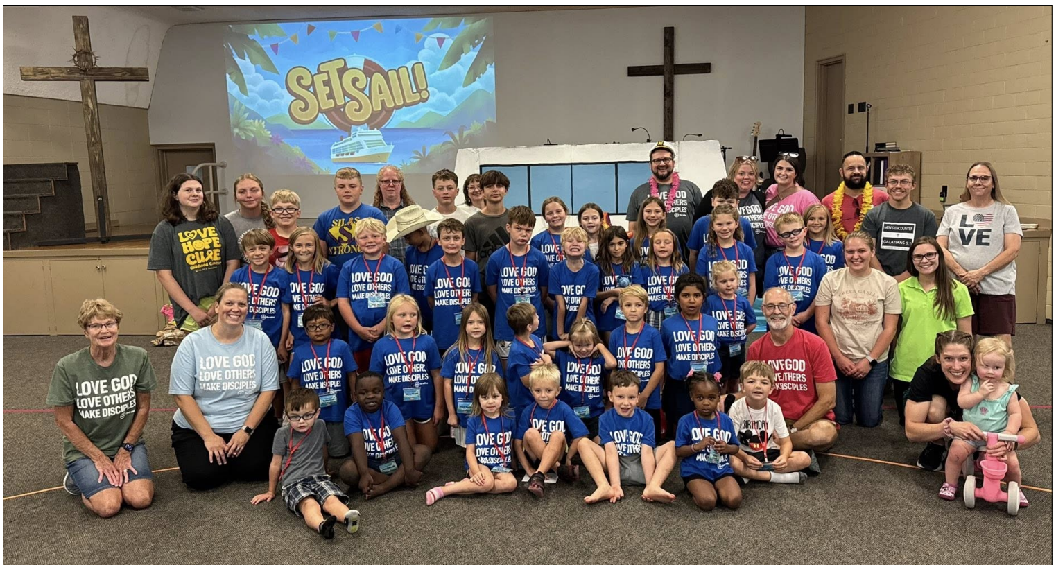
2025 VBS Group Photo