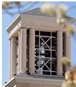
The Marsh Memorial Carillon and Tower atop Marsh Hall at Concord University