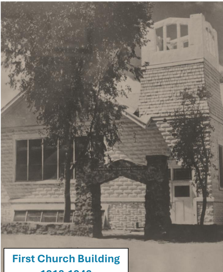
First Church Building 1918-1946

"Earn all you can, save all you can, give all you can." John Wesley