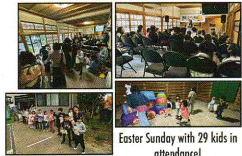
Easter Sunday with 29 kids in attendance!