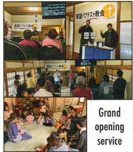
Grand opening service