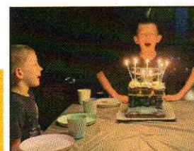
Atlas is now 12 years old! Thank you for all the birthday cards!