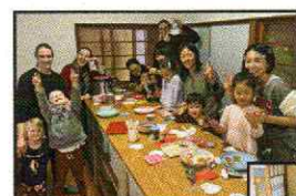
Fun Spring activities!