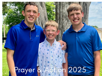
Prayer & Action 2025

It's not too late to purchase tickets or make a donation.