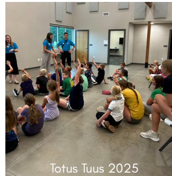
Totus Tuus 2025