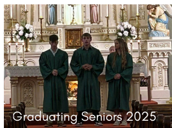
Graduating Seniors 2025