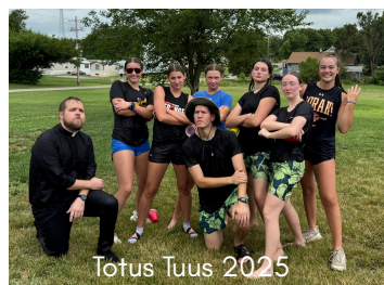
Totus Tuus 2025