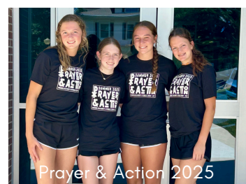
Prayer & Action 2025