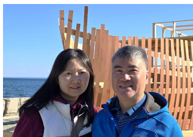
Stepping into the Mission field.

When we saw an opportunity to serve at this guest house, we were excited. It is like taking care of a motel which somehow was on our minds during the past year. It will also be a great chance to step into the mission field through Send International Organization. Although this does not involve or focus on Biblical teaching, preaching or sharing the Gospel to a particular group of people, we are indirectly serving a community that shares the Gospel. It is also a great place to get to know the different missionaries who serve the minority groups in Alaska. This guest house is a hub where they can get some medical checkups, have a short term stay before heading back to their hometown. By