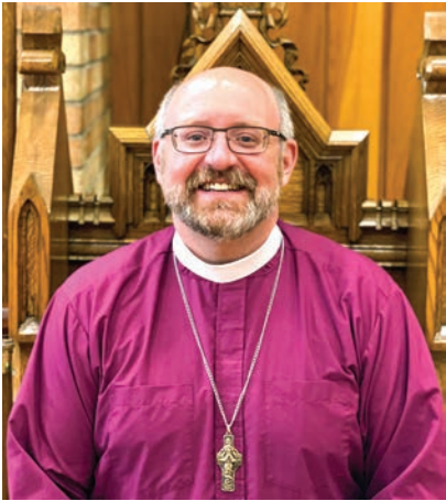
Bishop STEPHEN LONDON Diocese of Edmonton