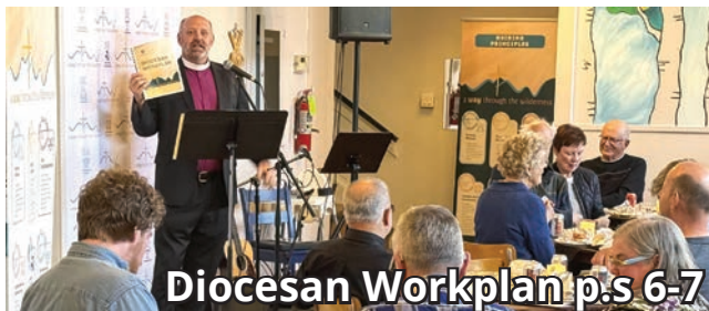
Diocesan Workplan p.s 6-7