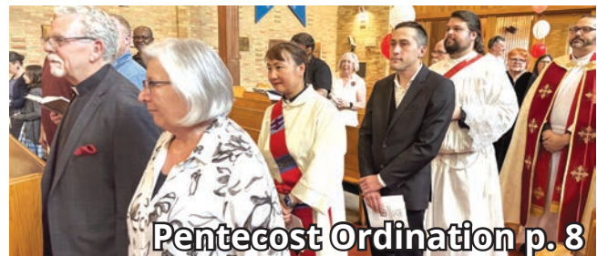
Pentecost Ordination p. 8