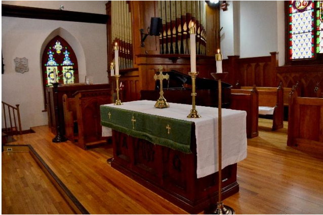
Pentecost Altar, Christ Church Anglican, Meaford

Please join us SUNDAY for In Person Worship!