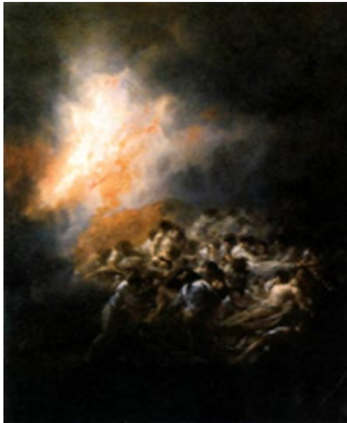
Fire at Night

Morning Prayer and Commissioning of Our Lay Candidates for the Lay Leadership Team and Lay Eucharistic Ministries Team of St John the Baptist, Cobble Hill