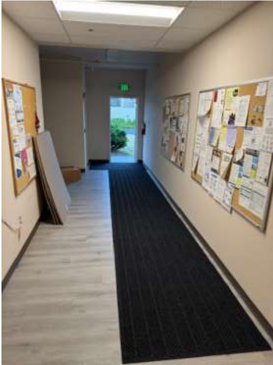
Top left: New mats for the downstairs entrance.