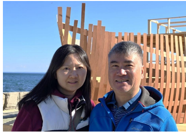
Stepping into the Mission field.

When we saw an opportunity to serve at this guest house, we were excited. It is like taking care of a motel which somehow was on our minds during the past year. It will also be a great chance to step into the mission field through Send International Organization. Although this does not involve or focus on Biblical teaching, preaching or sharing the Gospel to a particular group of people, we are indirectly serving a community that shares the Gospel. It is also a great place to get to know the different missionaries who serve the minority groups in Alaska. This guest house is a hub where they can get some medical checkups, have a short term stay before heading back to their hometown. By