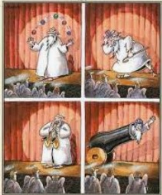
Acts of God

It's a funny thing - when you talk to God, you're religious. When God talks to you ... you're a lunatic.