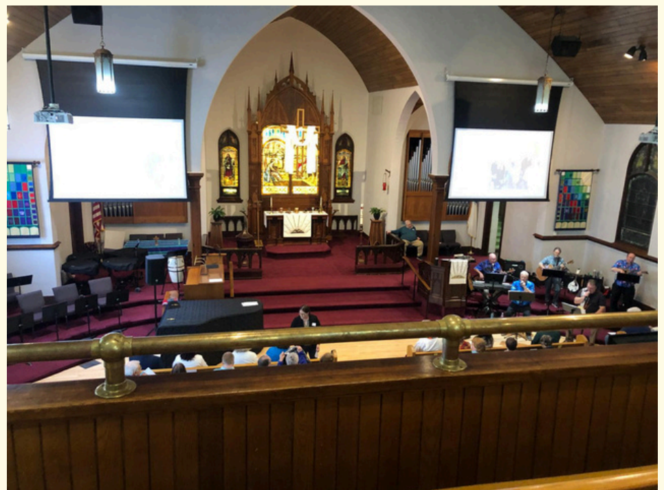
View from the balcony Bethany Lutheran Church Rice Lake, WI