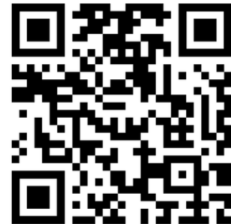
R.C Sproul Brief Explanation

Looking at the following verses discuss together what we are told about this 'covering' or 'imputation.'