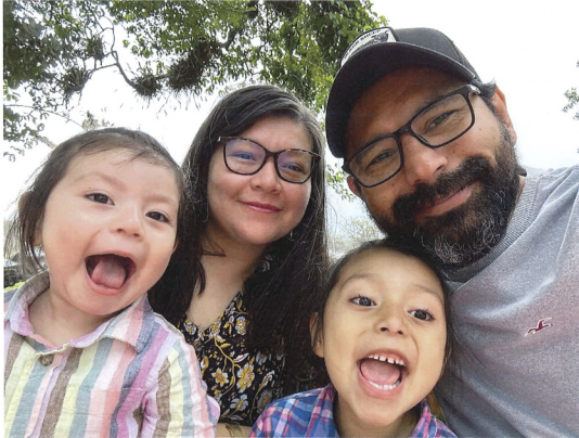
MERCY 5 years old