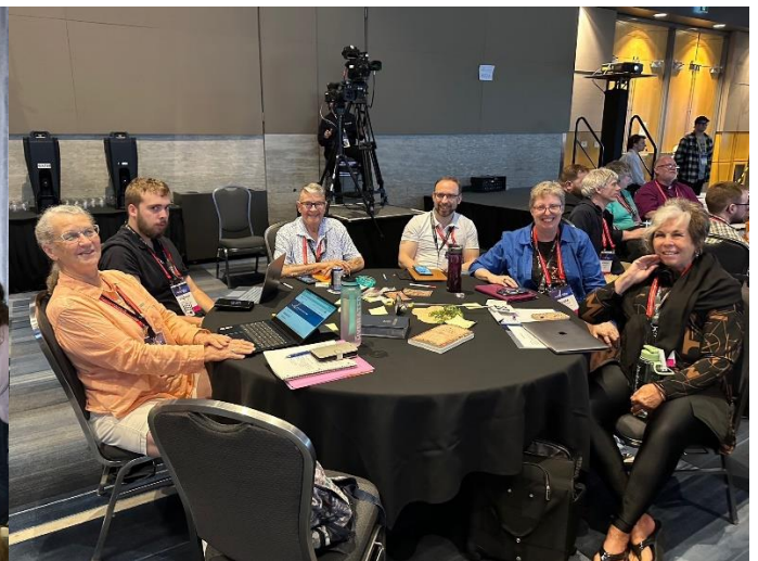
Right: Our Territory General Synod Representatives