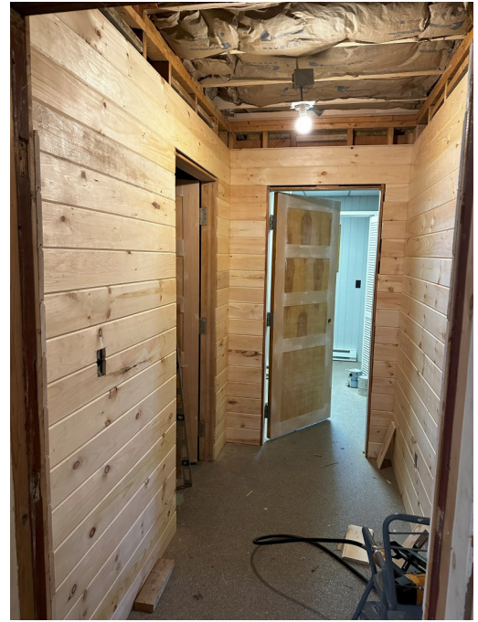
Hallway to Bunkroom & Bathroom

This past month, the Kentland interior has really begun to take shape. The new ceiling and LED lights make the space look clean and bright, while the pine walls give it that rustic feel that we were hoping for. The restored fireplace now looks better than I ever imagined!