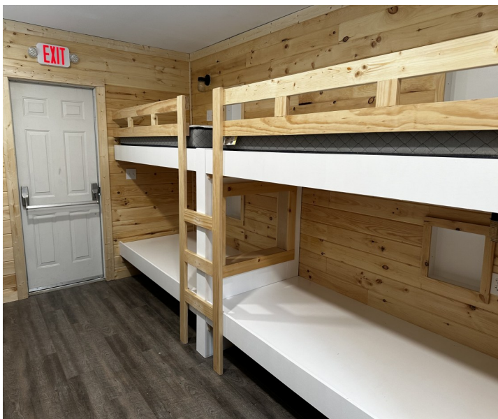
Single Bunk Beds