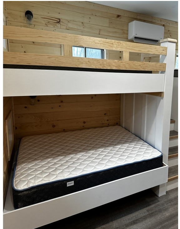
Double Bunk Beds