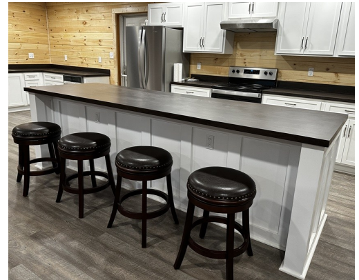
Island Bar Stools