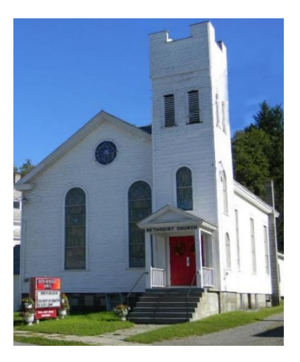
PO Box 47, South Otselic, NY 13155 https://www.sotselicumc.org/