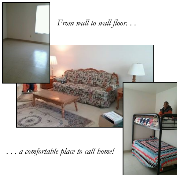
From wall to wall floor. . .

Typically, when we enter a new tenant's apartment it is wall to wall floor, a few blankets in the corner and a trash bag and backpack nearby.