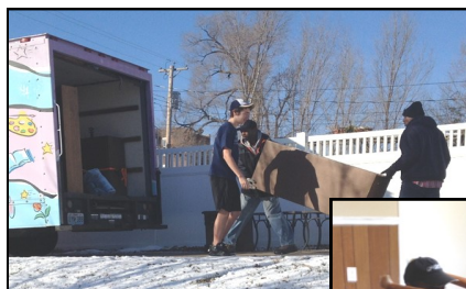
Giving and giving back. . .

Without the generosity of our church family, friends and acquaintances, New Beginnings could not exist. They somehow manage to keep up with our constant and current furniture needs. Much of our muscle comes from former "new tenants" who offer their services free of charge as a way of "paying forward". Like the rest of us they often find the real joy in helping others.