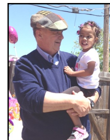
"OL", 18 months later

"Among my many blessings as a NB volunteer was a moment made memorable by a pint sized, little elf. She weighed about as much as a humming bird and is as beautiful & delicate as a butterfly.