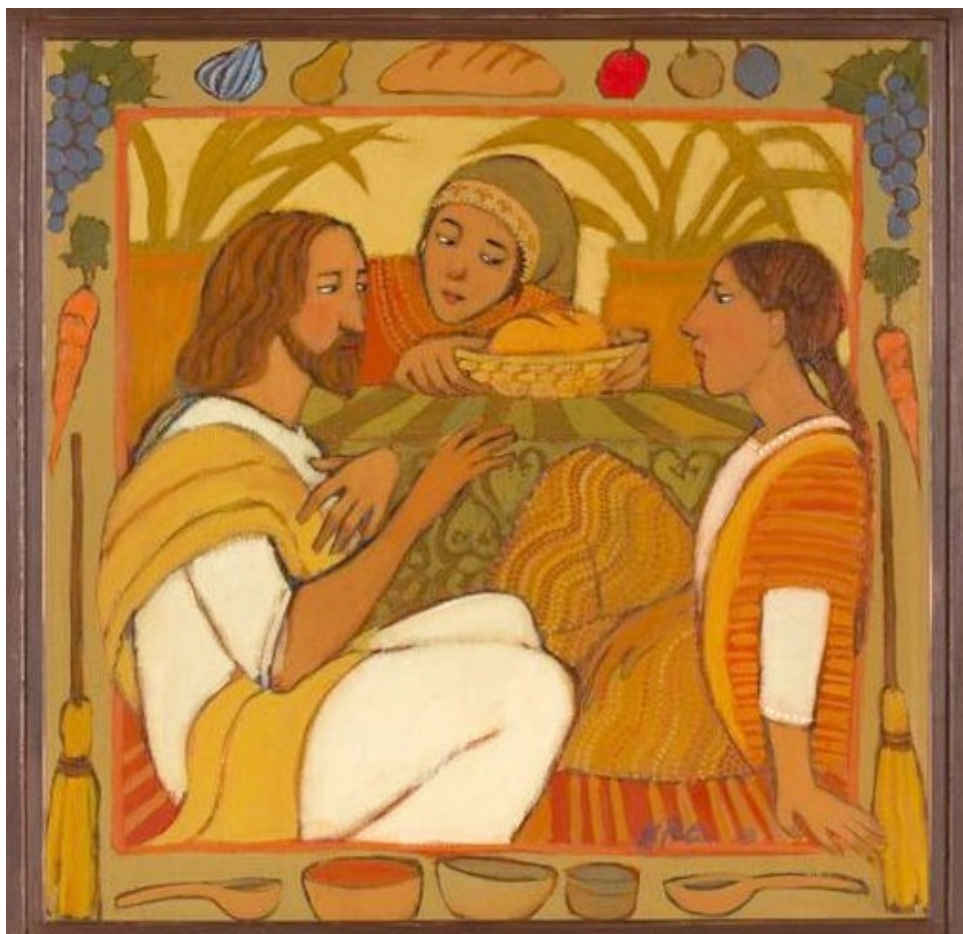
"Mary, Martha, and Jesus"