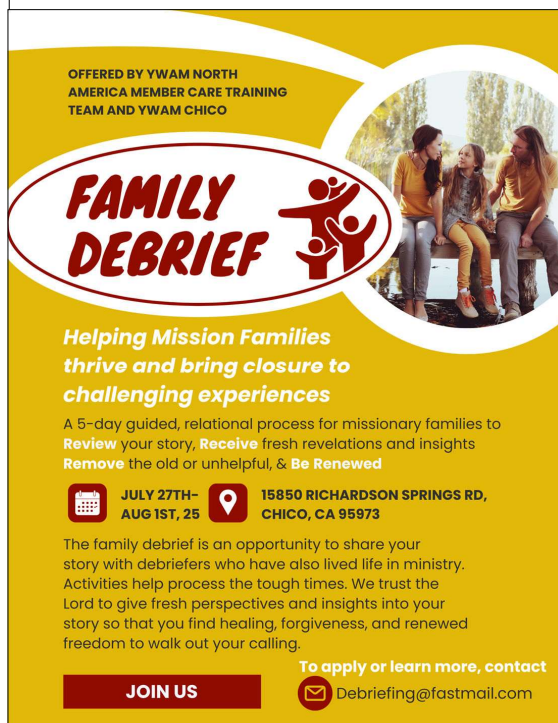
Photo: TOP: the Himalayas on a clear day (photo credit to unnamed friends who work there.) Left: The flyer for this year's Family Debriefing Retreat at YWAM Chico