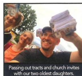
Passing out tracts and church invites with our two oldest daughters.