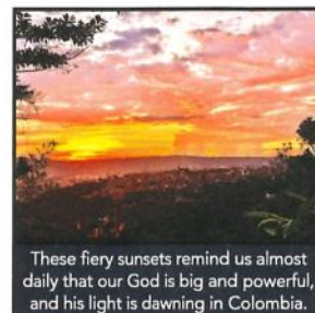
These fiery sunsets remind us almost daily that our God is big and powerful, and his light is dawning in Colombia.