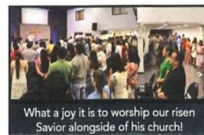
What a joy it is to worship our risen Savior alongside of his church!