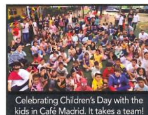
Celebrating Children's Day with the kids in Café Madrid. It takes a team!