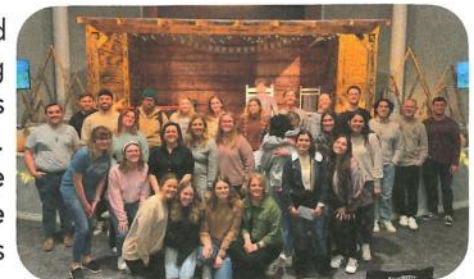
Some of our local CFC students at the retreat.

This year's retreat was one of the best yet! We had record attendance with 110 registered coming from NC and many other states. The testimonies we heard of how God worked was overwhelming. Two young adults got saved and the last service had to be extended because young adults were continuing to pray and worship! Many decisions were made as they went forward attaching cards to clips at the altar.