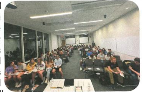
Small groups at the end of Bible Study

We started the spring semester with record attendance of 92 students with 5 students calling on Jesus as their Savior that night! One of the young men that got saved that night recently brought visitors with him. One of his friends rushed to the front at the end of Bible study and called on Jesus to save him! He did this with his friends and other people standing around watching and listening. Pray with us that God will allow us to continue reaching more students!