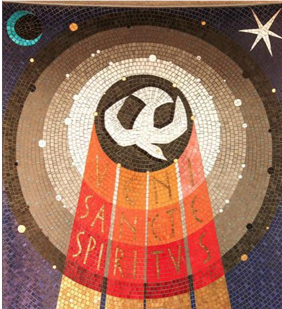
"Veni Sancti Spiritus", St. Aloysius Somers Town, London, England

The Zoom codes for all our worship services are: