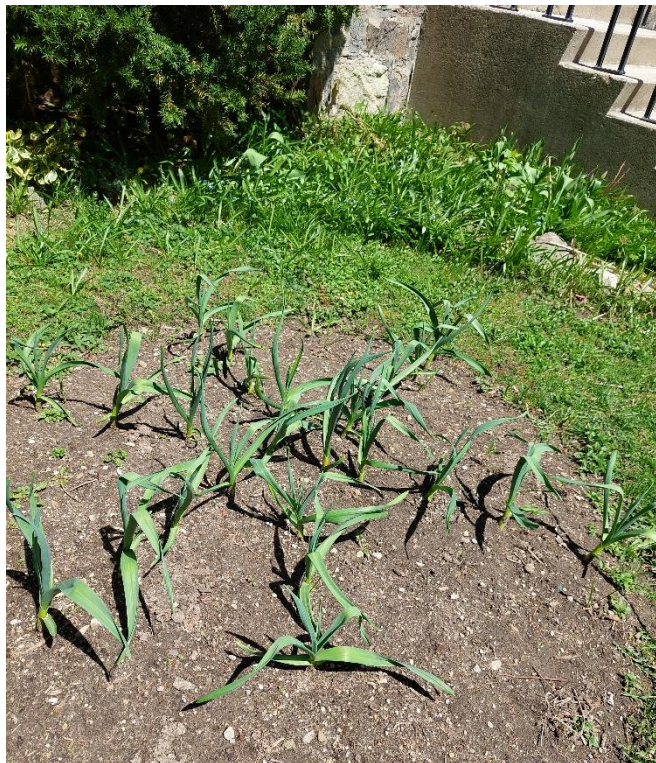
CC Community Garden - garlic early May