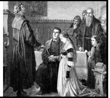
Table Talk: Learning from History

... Martin Luther's Wedding, that is. We're planning on a grand celebration of the 500 th anniversary of wedlock for Katharina von Bora and Martin Luther June 22 nd at 4:30pm . There will be a wedding cake, of course, along with all the potluck goodies that you'd like to share. Come help us cheer on the newlyweds on their 500 th year of marital bliss! Sign up in the centrum.