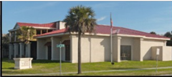
Worship on the Beach