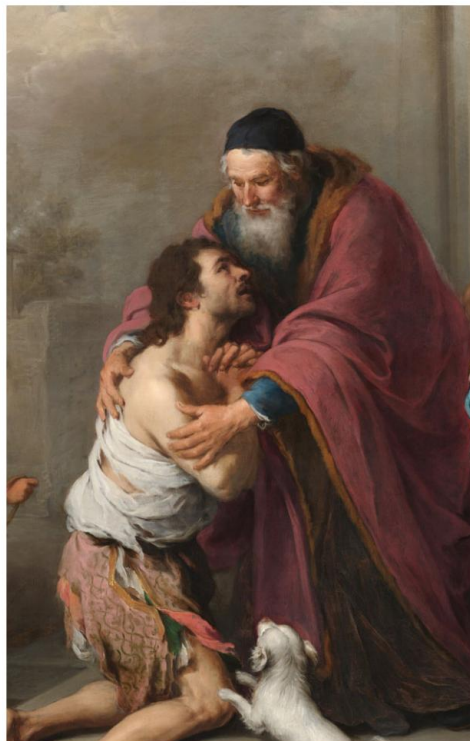
detail from Bartolome Esteban Murillo (1667-1670)

This is a great image of the cross. It is God's arms extending to the whole creation in love saying, "I will take your pain and suffering from you and put it on myself. I will give my life for your well-being because I love you."