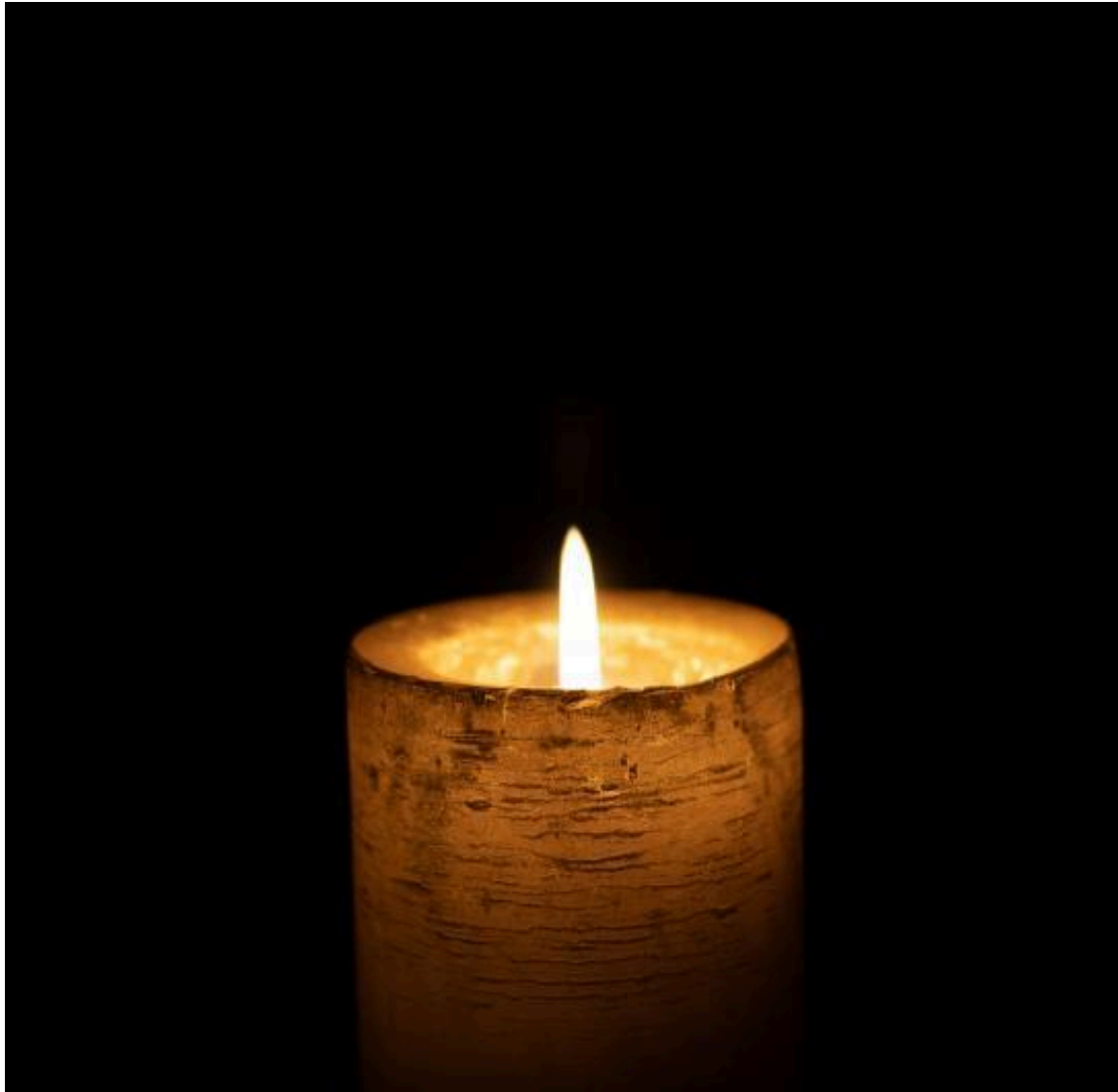
Candle burning in the dark/ image by Mirko Fabian, 2021, Creative Commons.