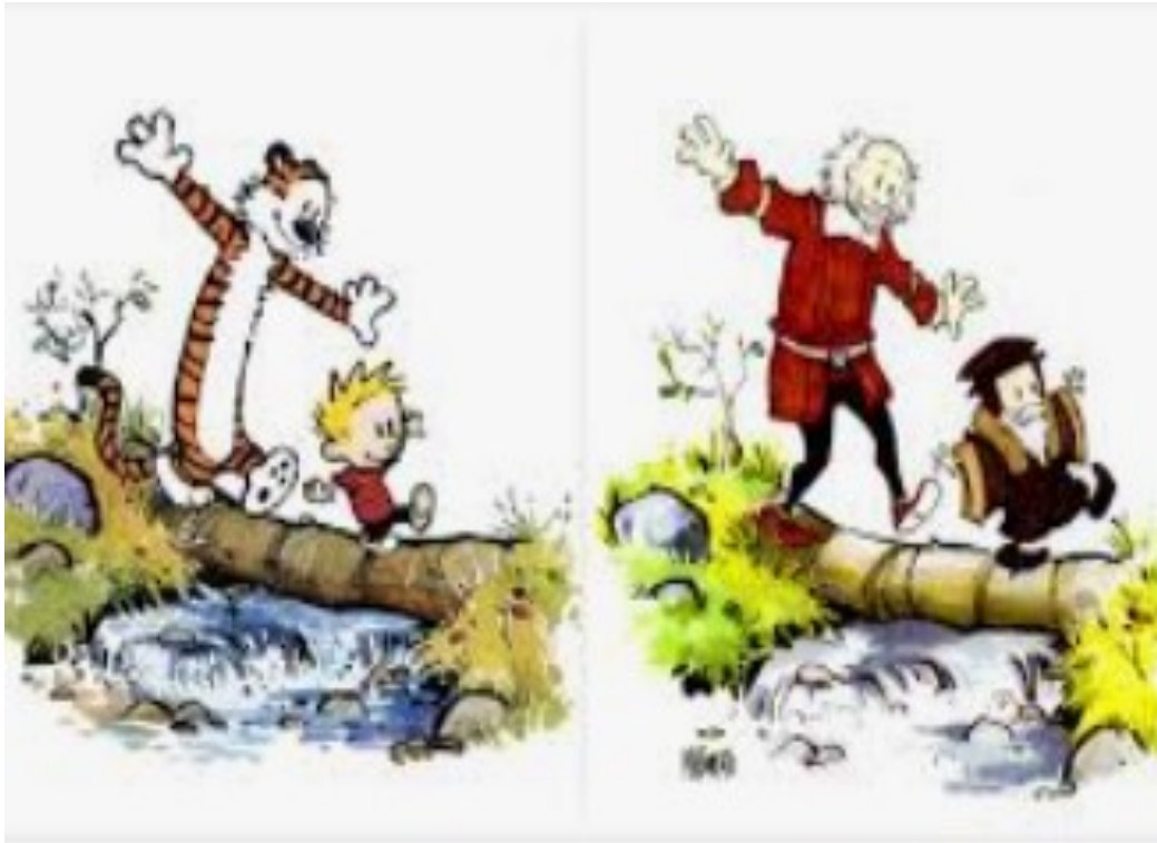
Calvin and Hobbes (the real ones)