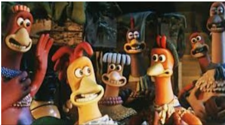
That awkward moment in church as a new person when they're looking for volunteers.

Whenever the Lord gives you the perfect parking spot