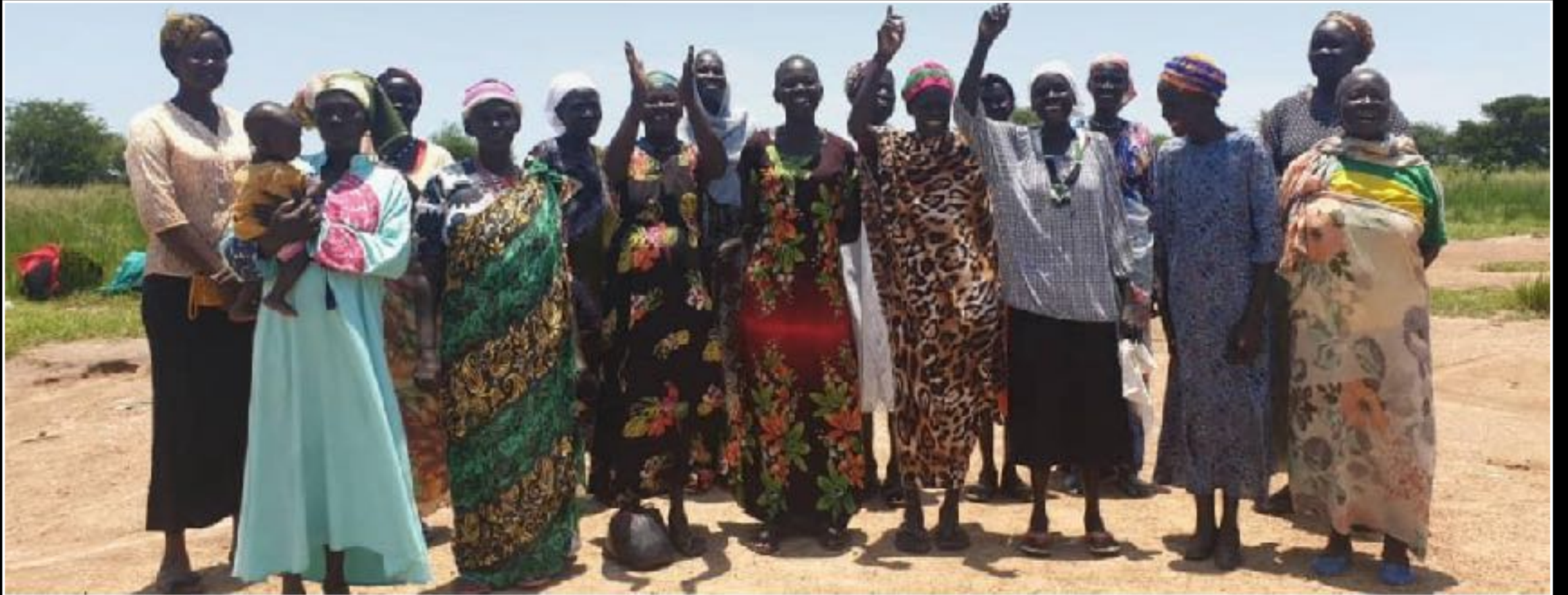
10 New Baptisms in South Sudan