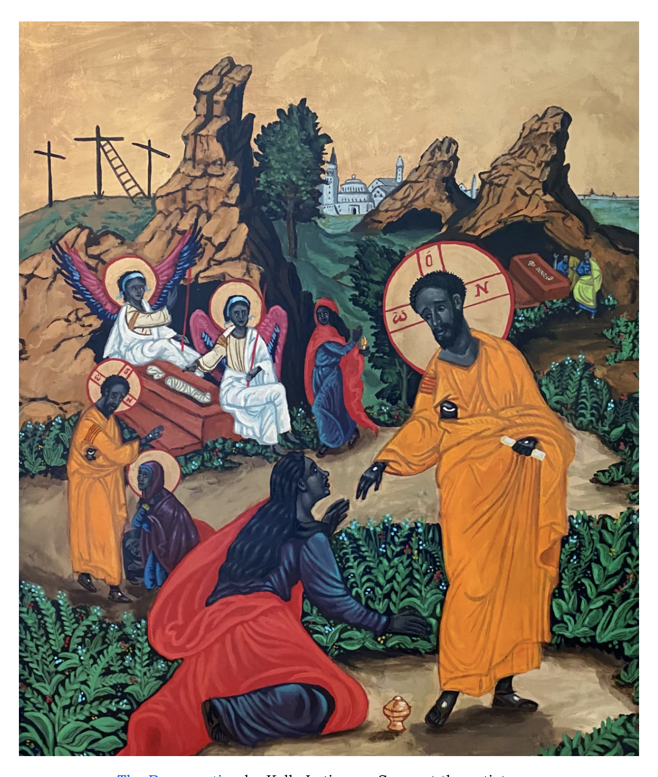
<u>The Resurrection</u> by Kelly Latimore. Support the artist.