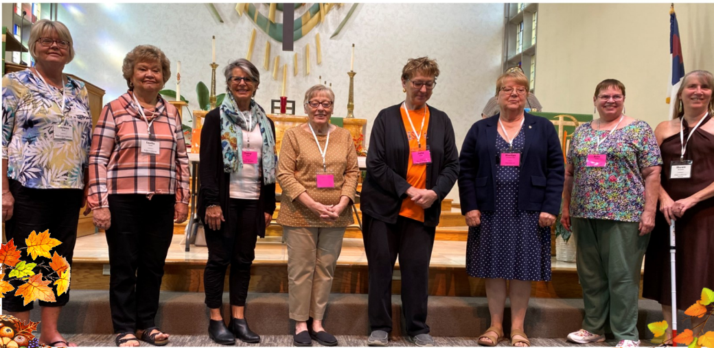
2023-2024 OFFICERS AND BOARD MEMBERS