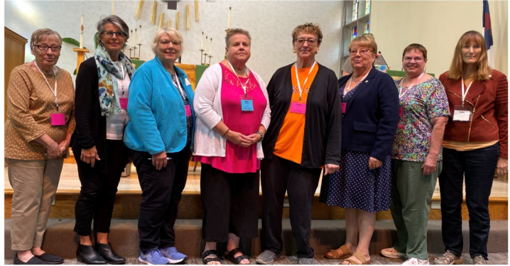
VOTING MEMBERS TO THE 2023 TRIENNIAL CONVENTION