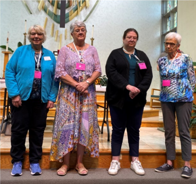
OUTGOING BOARD MEMBERS