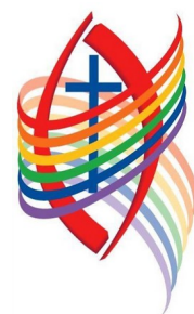
Crest of Affirm United

Comox United Church is a faith community within the United Church of Canada. Our central values appear at the bottom of this page. We are one of over 300 Affirming United Church Ministries across Canada, which means we affirm, include, and celebrate people of every age, race, belief, culture, ability, income level, family configuration, gender, gender identity, and sexual orientation in the life and ministry of our church, and proudly display the crest of the association of affirming churches known as Affirm United.