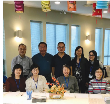
Picture with some gospel core team members before the start of ACM event in September 2023.

We encounter God more often in our day-to-day lives when we are prepared to move outside our comfort zones and put our trust in Him. Would you like to experience God's power and grace via sharing the Good News? Join us every first and third Saturday of the month at 10 a.m. outside the sanctuary and experience God's amazing grace!