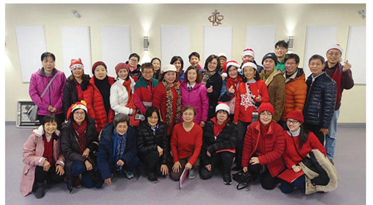
Christmas Caroling with brothers and sisters from various churches - December 2023