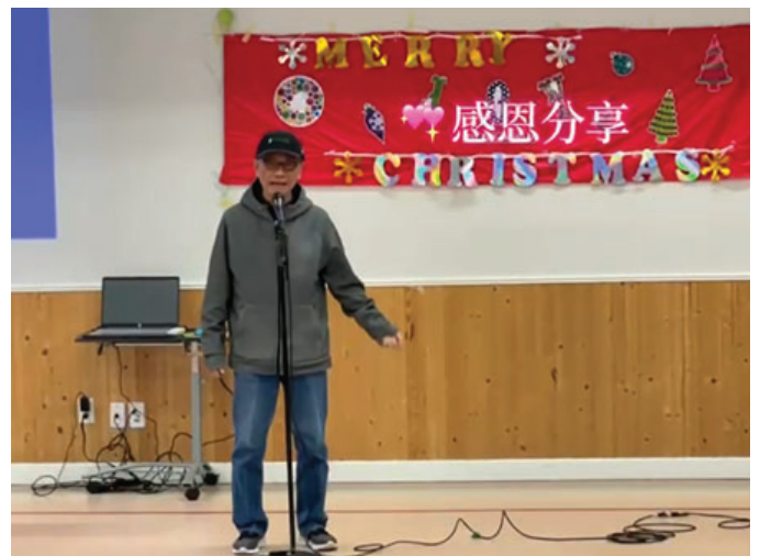
Christmas Celebration 2023.