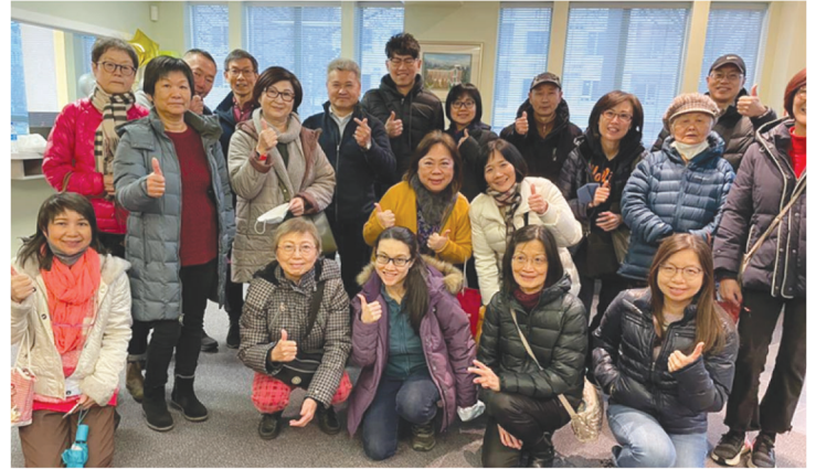
Partnering with VCCSTM for Saturday outreach at WAC in early 2023

Three additional events happened that made the second half of 2023 an amazing year. First, 120 people attended an in-person gospel music concert hosted by our church and the Hong Kong Association of Christian Musicians (ACM). Even though less than half of the sanctuary was seated at the start of the event, God's amazing love attracted 7 people to accept Christ that evening. Second, we had the opportunity to care for the elderly residents of the two senior homes that our church had visited every other week before COVID-19. One of the homes even invited us to sing there once a month beginning in 2024! Finally, almost 30 brothers and sisters gathered at our church and joined Christmas caroling this year. This was the most people I have seen participate in caroling to date!