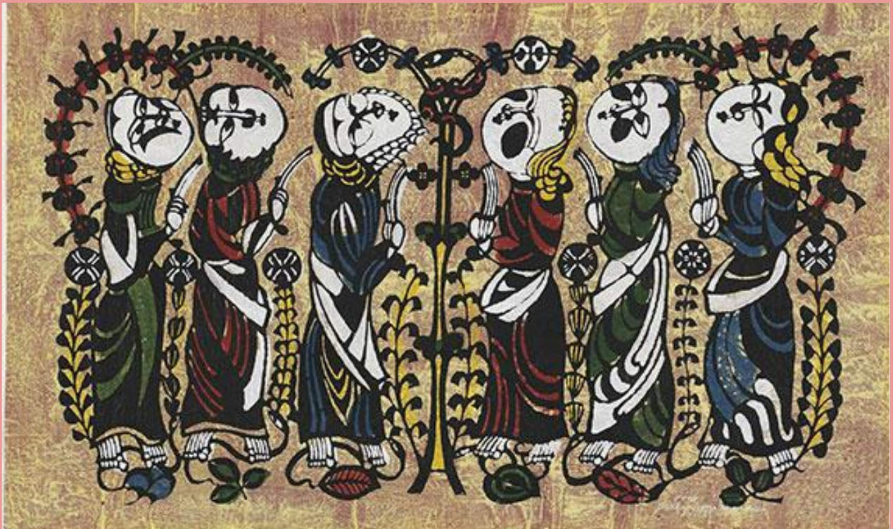
Watanabe Sadao (渡辺禎雄 1913-1996) "The Brazen Serpent" (青銅の蛇)