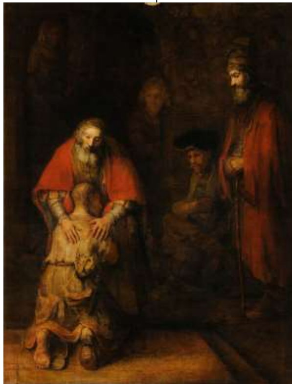
Rembrandt (1606 - 1669) titled, The Return of the Prodigal Son

It's to be honest with our God, and speak from the heart. As we pursue this journey to be real with the Lord, the masks will fall off and we can enjoy honest relationships with our God and our fellow travellers.