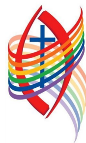
Crest of Affirm United

For more information about our faith community, see comoxunitedchurch.com